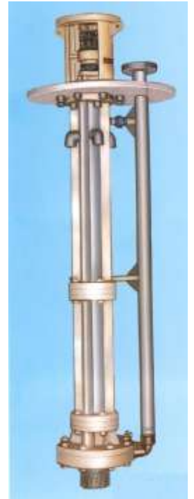
PUMP WITH CUTTER