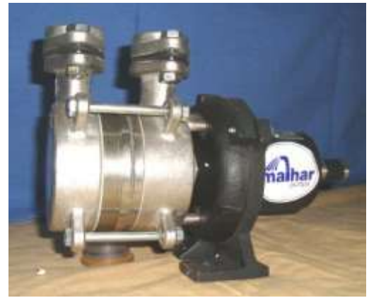
SP-3 MONOBLOCK PUMP