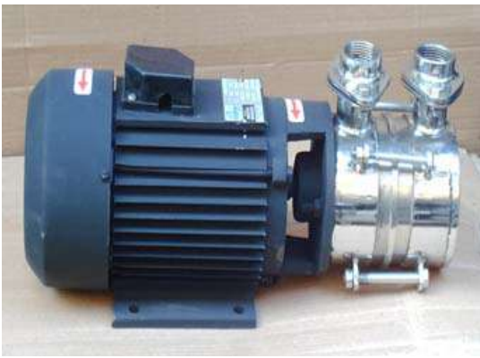
SP-2 BARE PUMP