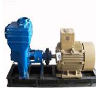
100 HP HIGH HEAD & HIGH DISCHARGE MUD PUMP AS PER CUSTOMER ORDER