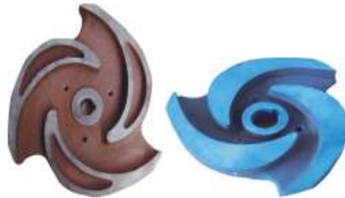
OPEN & SEMI-OPEN IMPELLER