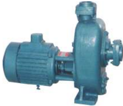
MONOBLOCK PUMP UP TO 7.5 HP