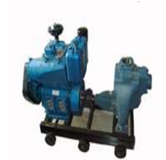
ENGINE DRIVEN TROLLEY MOUNTED PUMP