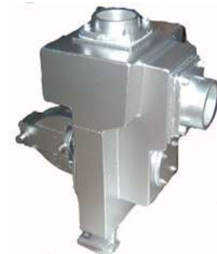
4" SIZE FABRICATED STAINLESS STEEL PUMP