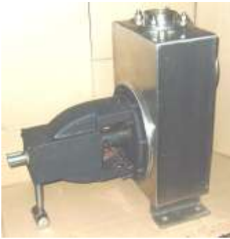
3" SIZE FABRICATED STAINLESS STEEL PUMP