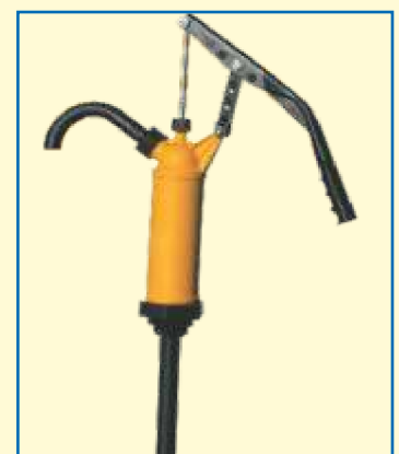
Piston type mini pump