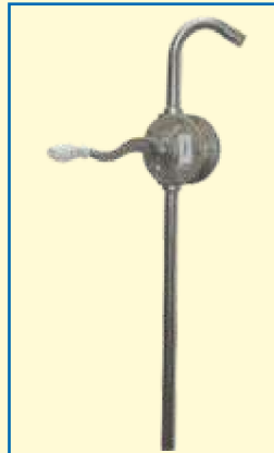
SS-316/SS-304 Hand Operated Barrel pump