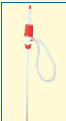
Siphon type hand Operated pump