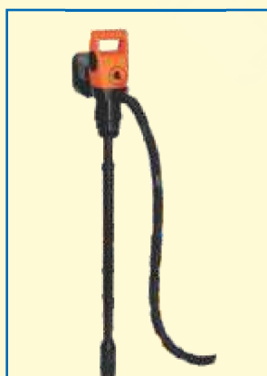
Motorised Barrel Pump Ac/dc Plastic For Fuel Only