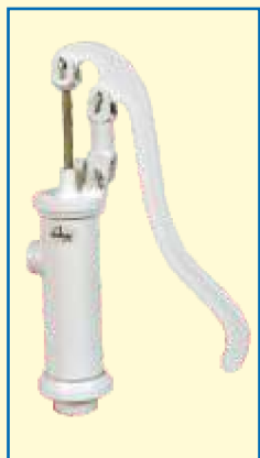
Piston type PP Barrel pump