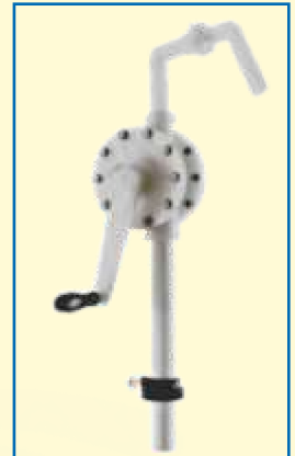
PTFE Hand Operated Barrel Pump