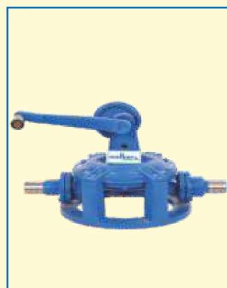
Diaphragm type Hand operated Barrel pump in CI/SS (100 % free