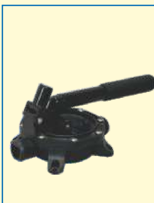
Diaphragm type Hand operated pump in PP material