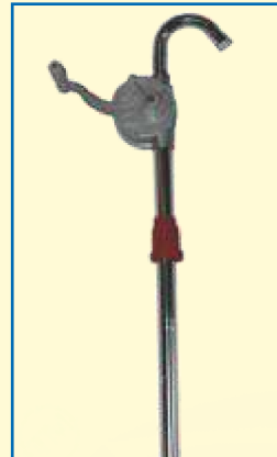
Aluminium Hand Operated Barrel pump