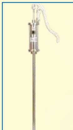
Piston type SS Barrel pump