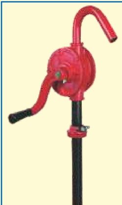
Cast iron Hand operated Barrel pump