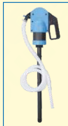
Lever Action PP barrel pump