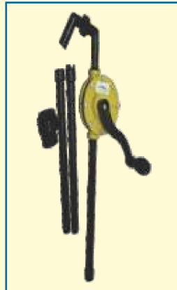
PP (Plastic) Hand Operated Barrel Pump