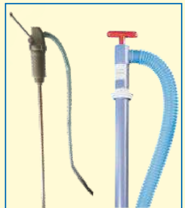
Lever Action Aluminium & Plastic Hand Operated pump