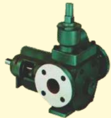
shuttle block pump