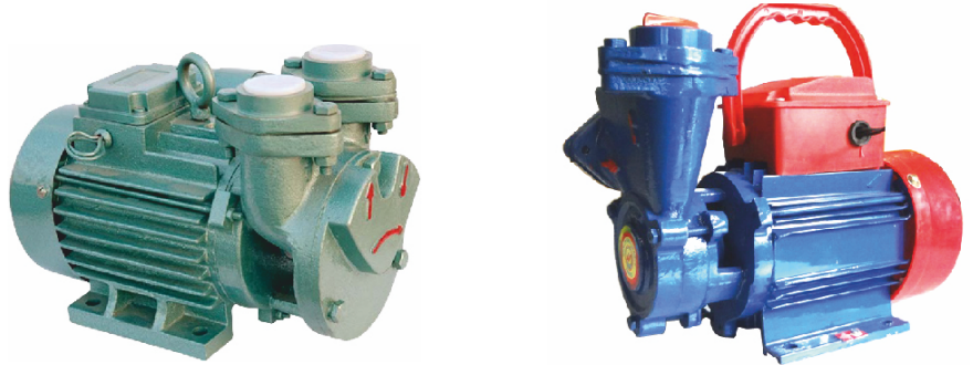
(Regenerative Impeller up to HP)